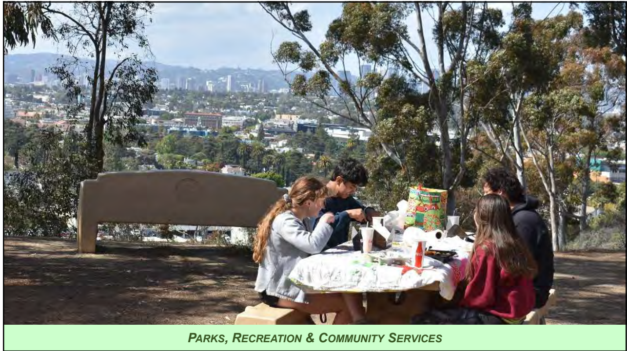
PARKS, RECREATION & COMMUNITY SERVICES