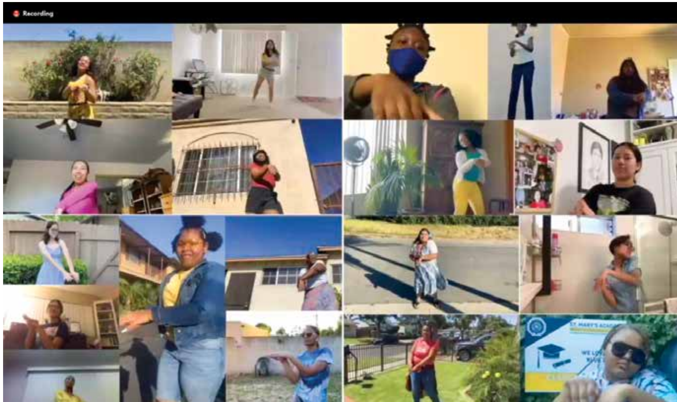
Screenshot of Zoom performance by Heidi Duckler Dance

The City of Culver City is participating with SMU DataArts to utilize The Cultural Data Profile. The City of Culver City, along with other funders, requires applicants to complete an annual survey that collects financial and programmatic data. Applicants will complete the online Cultural Data Profile and use that data as part of their application to all participating funders throughout the state. A short form is available for organizations with budgets of less than $50,000, making the data entry process faster and more equitable for small nonprofits. All applications must include the DataArts Funder Report for the Culver City Performing Arts Grant Program with their application. See Attachment B for further details.