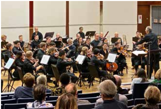
LA Doctors Symphony Orchestra at Veterans Memorial Auditorium

All other application materials, including budgets, reports, artistic samples and collateral documents, must be uploaded electronically online.