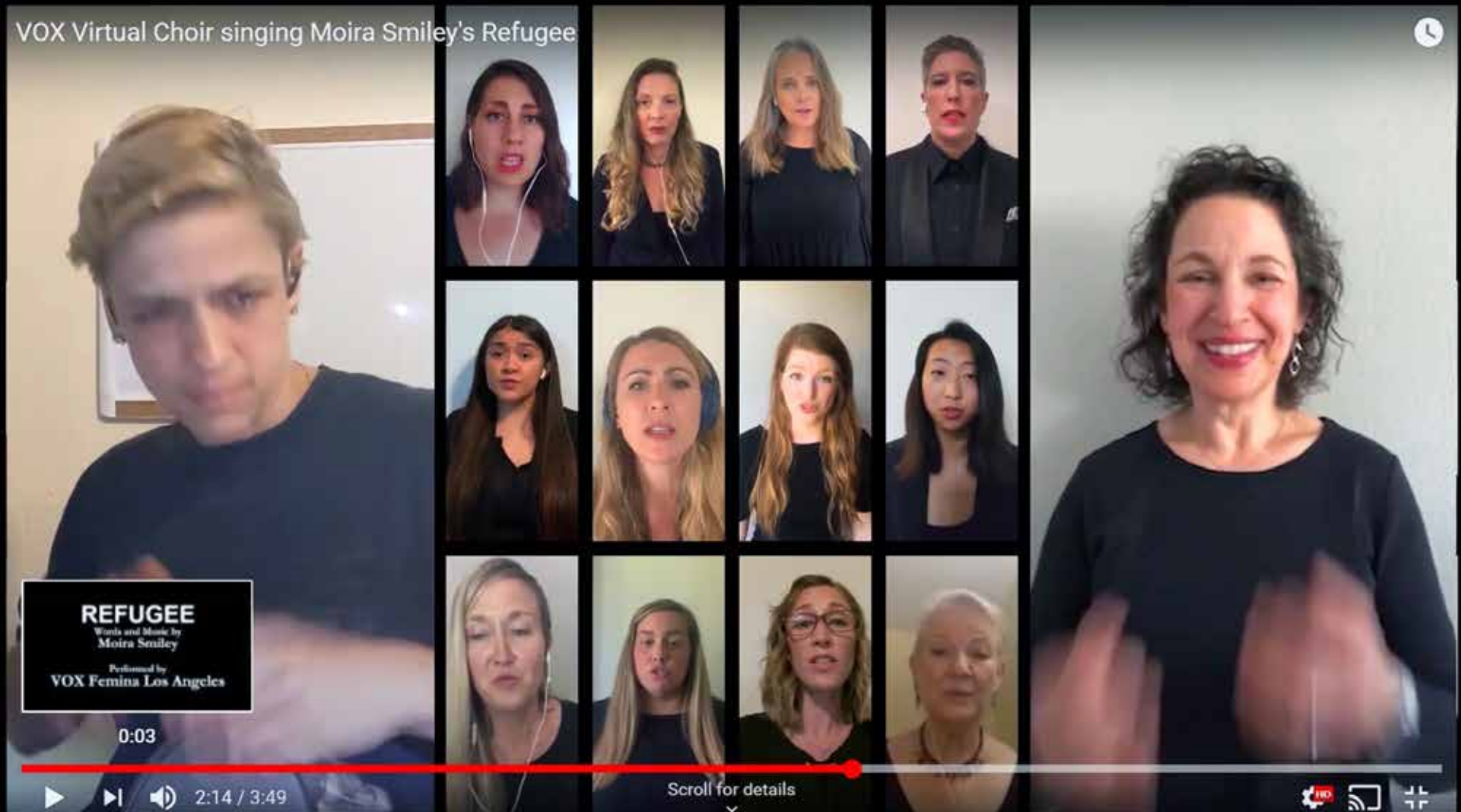
Screenshot of YouTube performance by Vox Femina Los Angeles