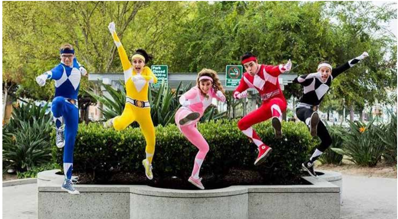
The Actors' Gang at Media Park

cultural.affairs@culvercity.org or (310) 253-5716