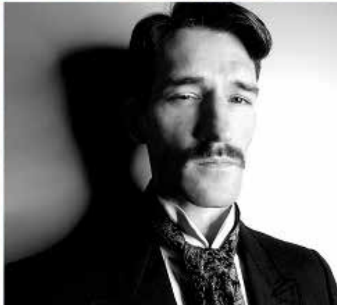
Screenshots of Zoom performance by Culver City Public Theatre