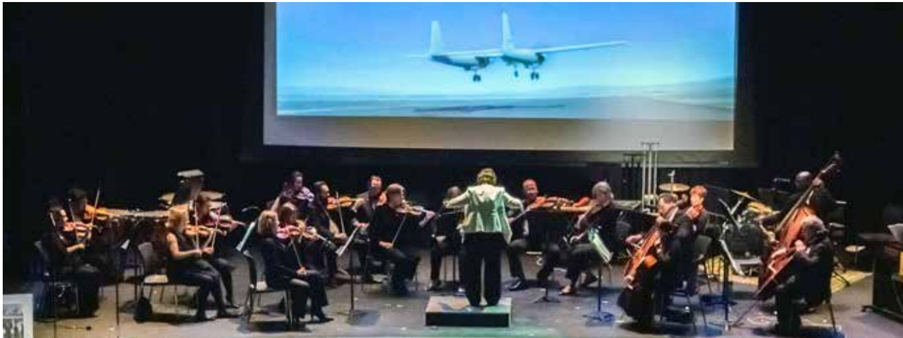
Culver City Chamber Orchestra at Turning Point School Auditorium