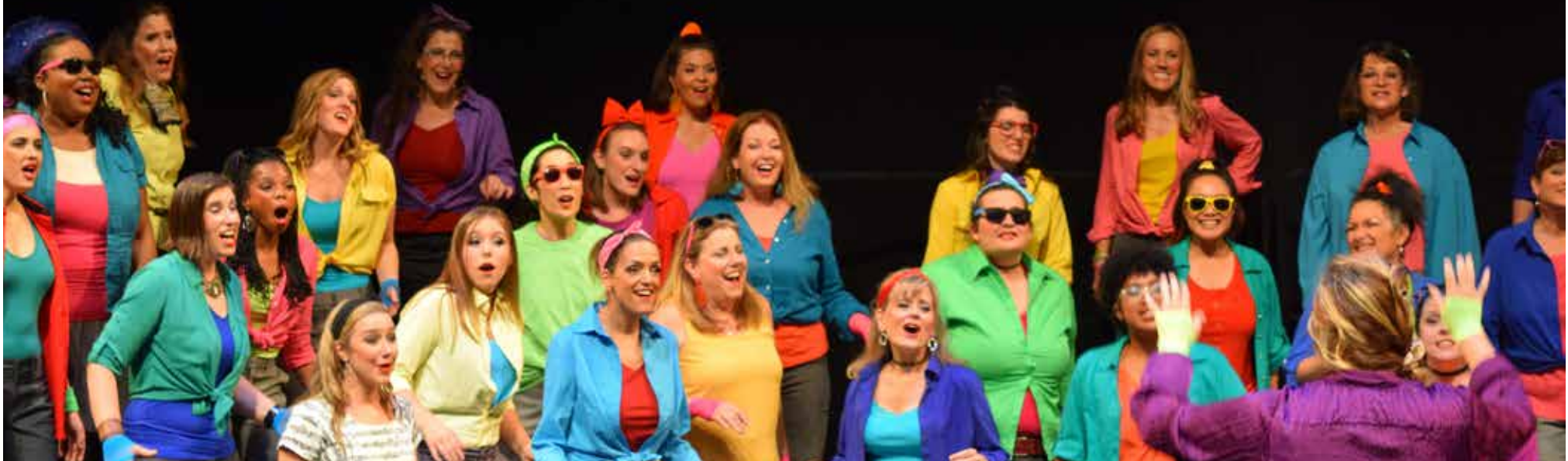
Santa Monica Chorus at Kirk Douglas Theatre

Performing arts organizations of all sizes are encouraged to apply to this program.