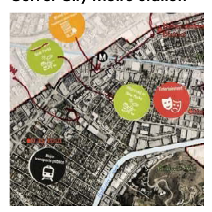
Culver City Metro Station

A mixed-use hub with mobility options for all, regardless of ability and age, that supports public transit and active transportation by up-zoning properties to mixed use that accommodates more dense housing along with new retail and commercial space; adding more trees; improving bike lane and sidewalk connectivity to activity centers like Main Street, Downtown, parks, and schools; and experimenting with micro mobility, ondemand shuttles, and other local transit options.