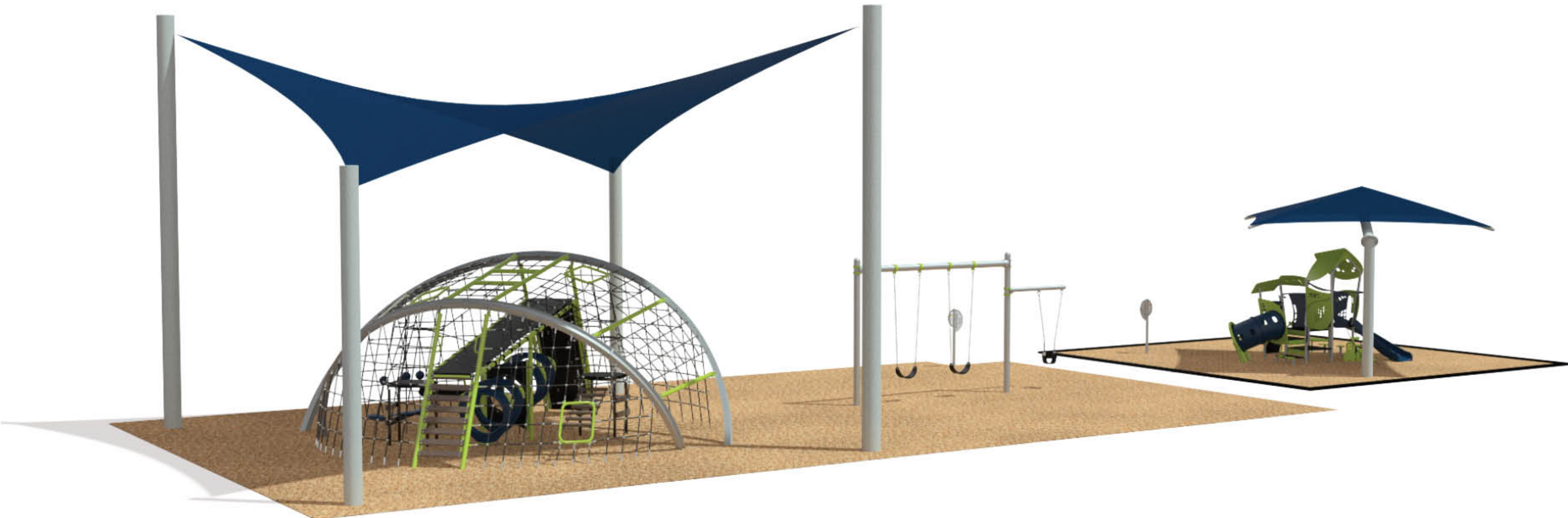
Image for illustrative purposes only. Does not represent the finished product. Not to scale.