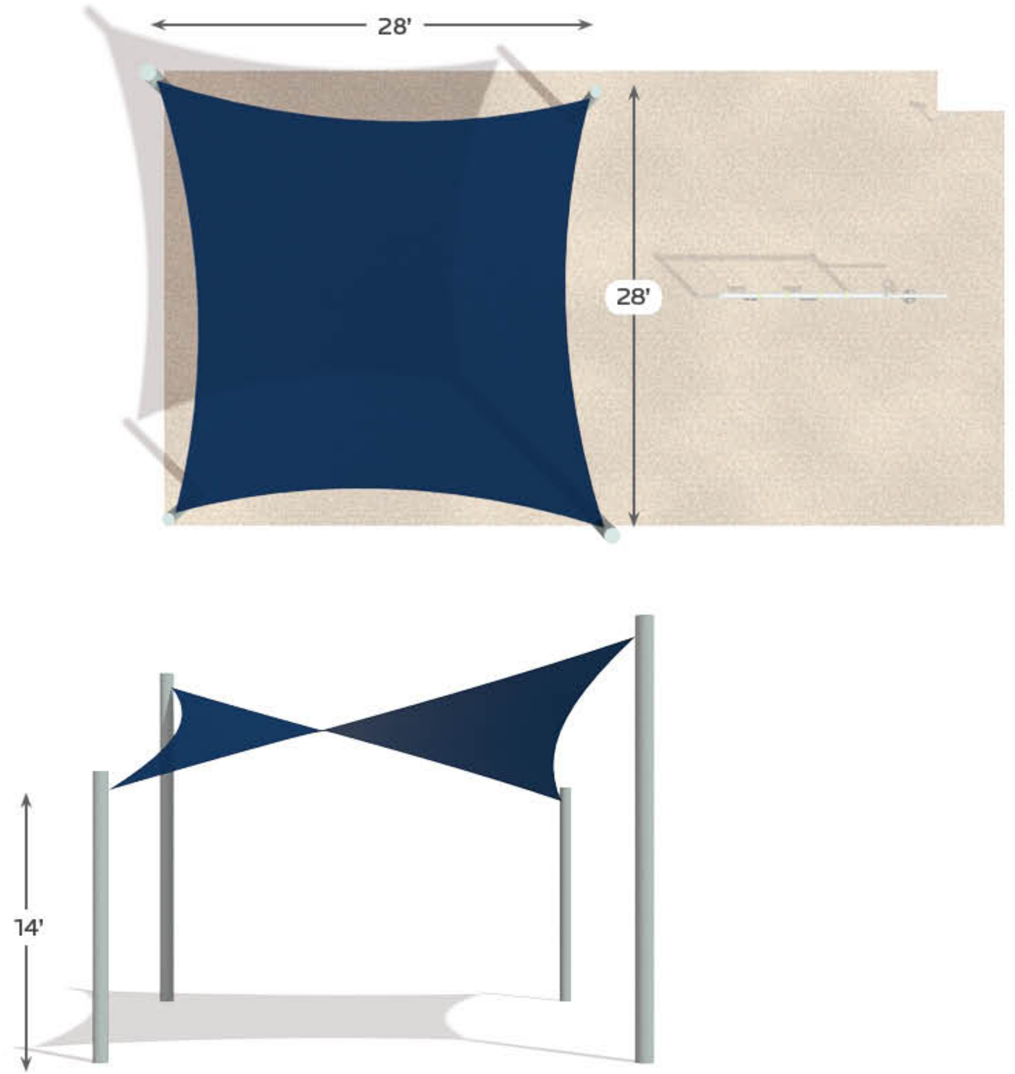
Image for illustrative purposes only. Does not represent the finished product. Not to scale.