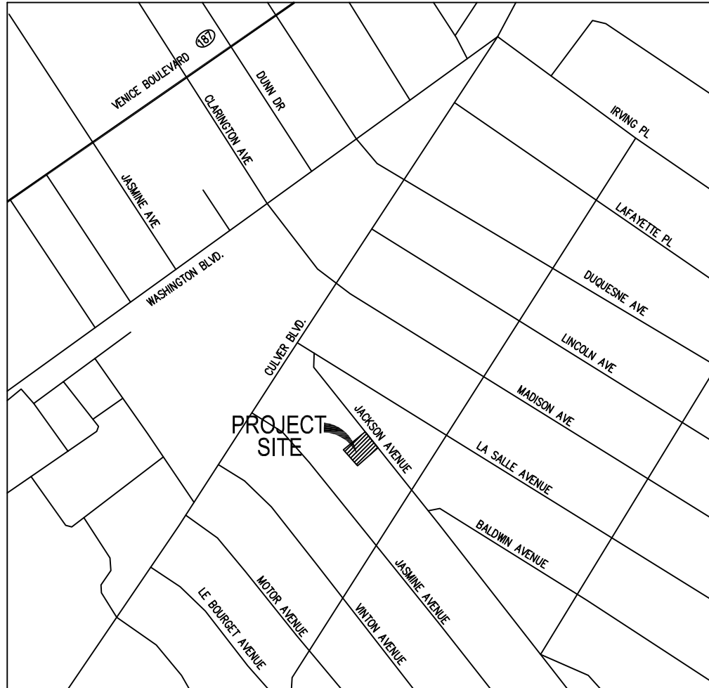
VICINITY MAP NTS

24881 ALICIA PARKWAY E-243 LAGUNA HILLS, CALIFORNIA 92653 ph. 9492281570 fx.9492082843