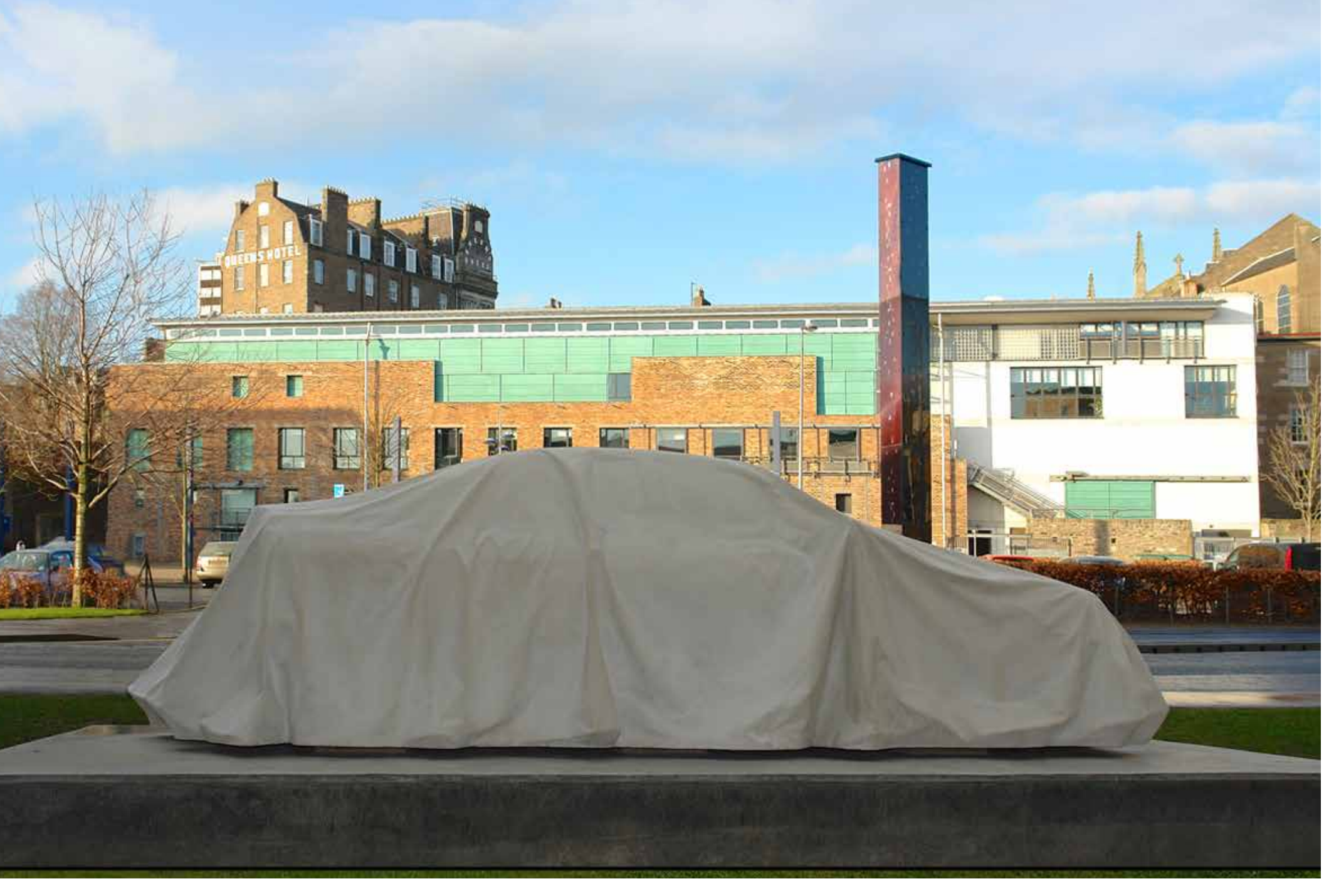
Catalyst, Dalziel + Scullion Dundee City Council, Scotland