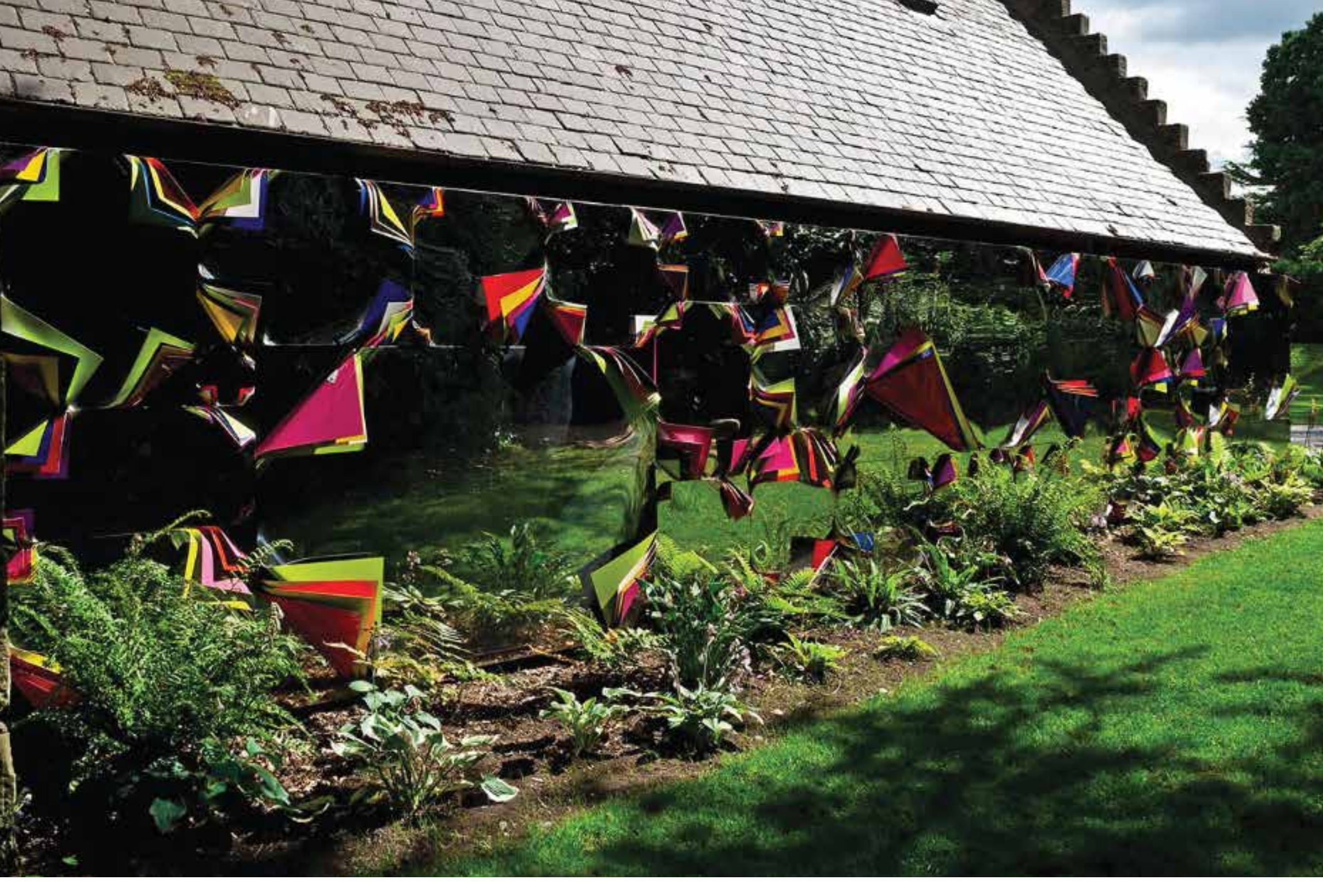
A Forest, Jim Lambie Jupiter Artland, Edinburgh

323.685.2800 | info@dysonwomack.com | 646 S. Atlantic Blvd. LA, CA 90022 | dysonwomack.com