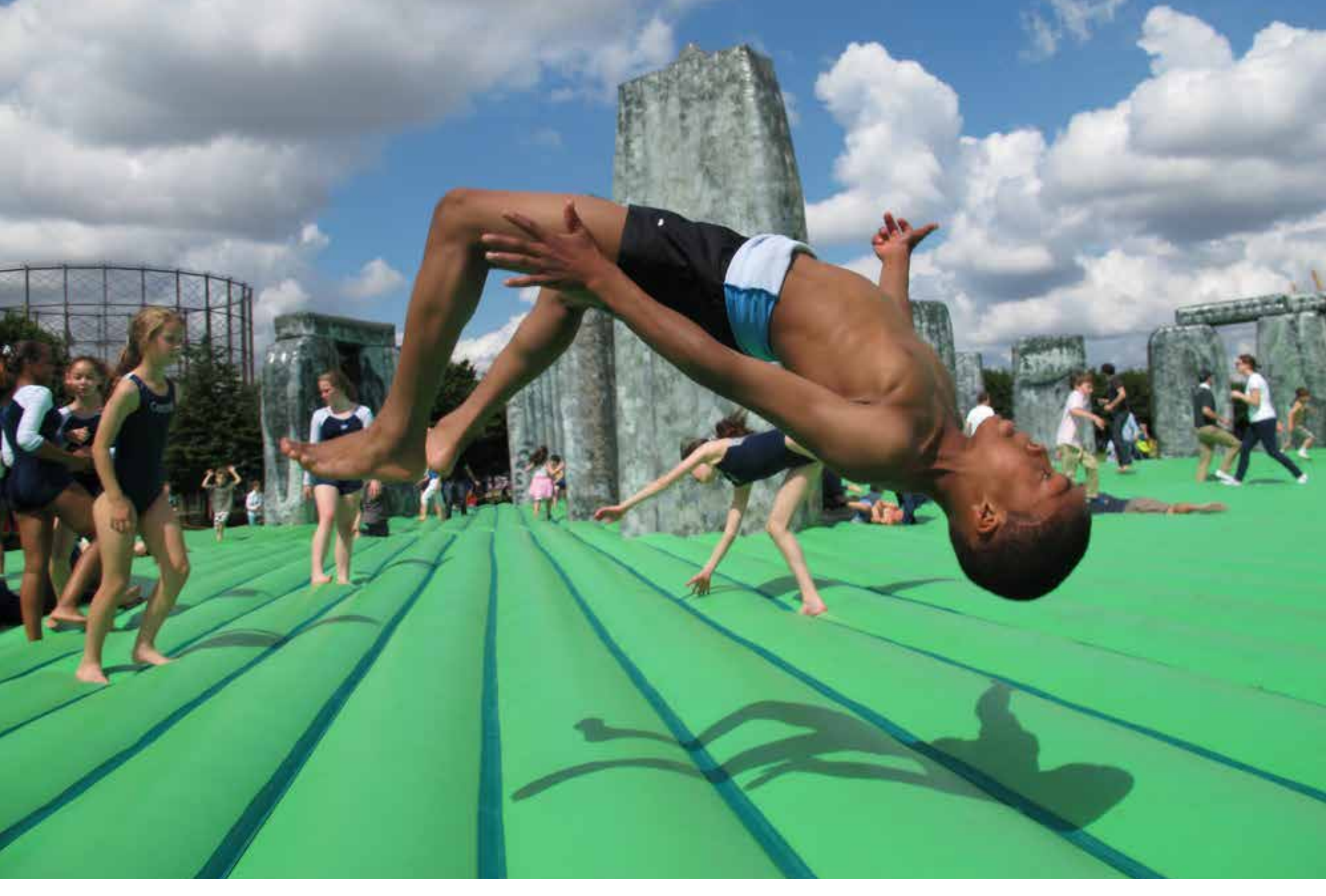
Sacrilege, Jeremy Deller Glasgow International, Glasgow