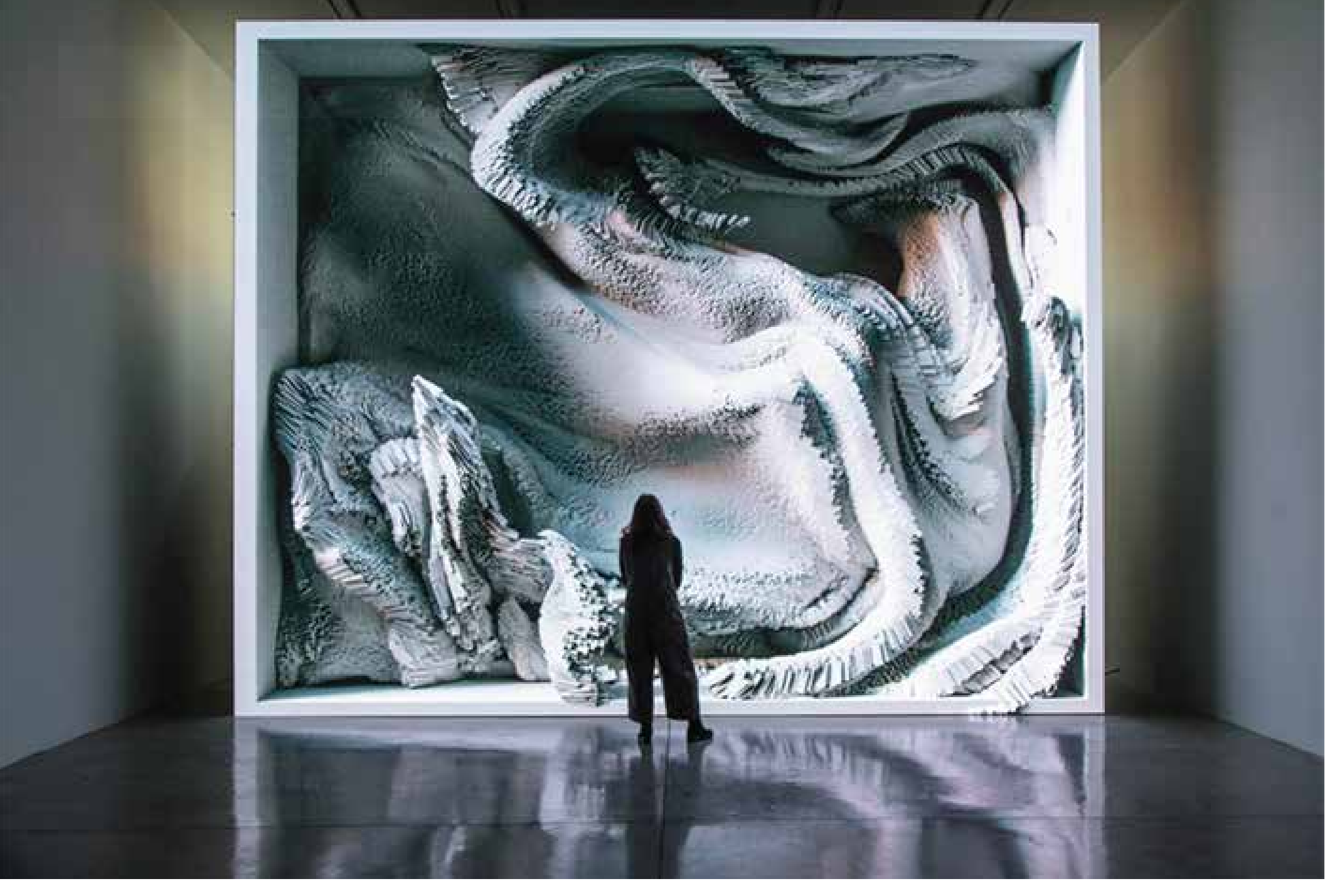
Melting Memories, Refik Anadol Pilveneli Gallery, Istanbul, Turkey