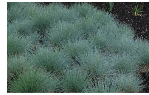
FESTUCA OVINA 'GLAUCA'