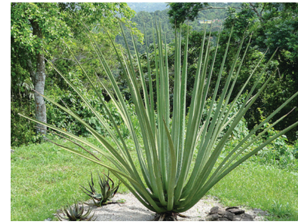
FURCRAEA MACDOUGALII MacDougall's Furcraea