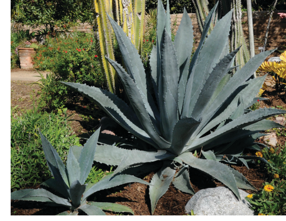
AGAVE TEQUILIA Weber's Blue Agave