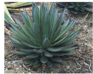
AGAVE 'BLUE GLOW'