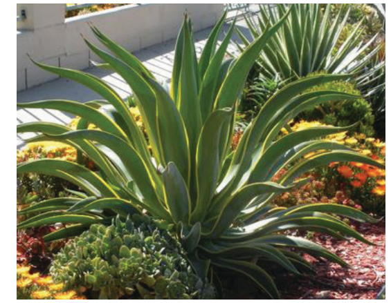
AGAVE DESMETTIANA 'VARIEGAT Smooth Agave