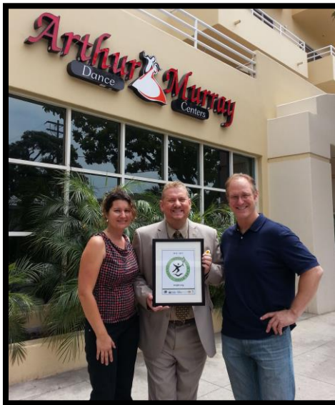
Arthur Murray Dance Center achieves GBC 2015