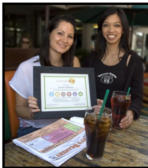
Barney's Beanery Santa Monica staff holding their BGP certificate in 2010