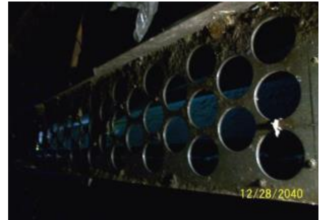
Same trommel after nightly cleaning