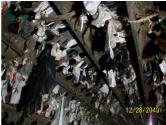
Plastic bags caught daily in Sunnyvale SMaRT trommel