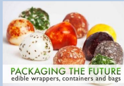
Edible Food Containers

Others: banana leaves, Tapioca, bull rush cattails