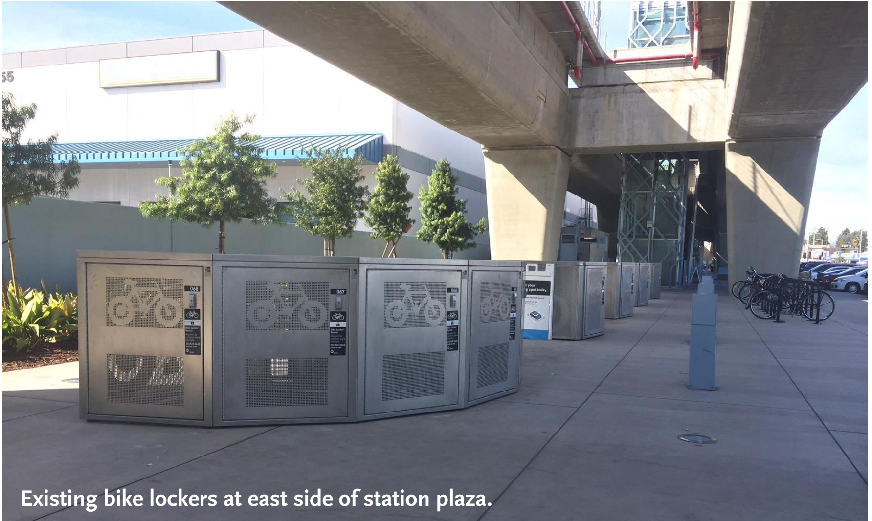
Existing bike lockers at east side of station plaza.