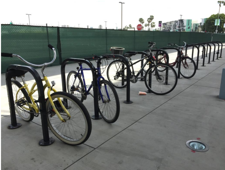
Bike racks at east side of station plaza.