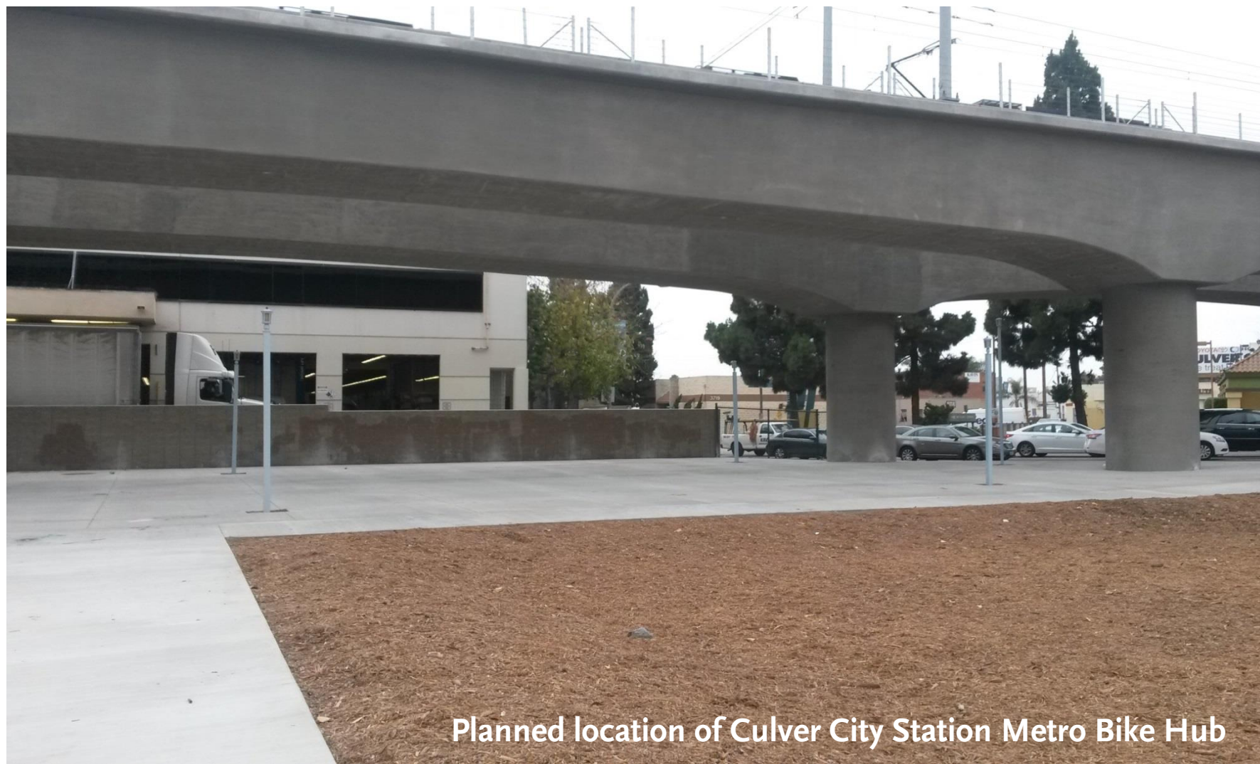
Planned location of Culver City Station Metro Bike Hub