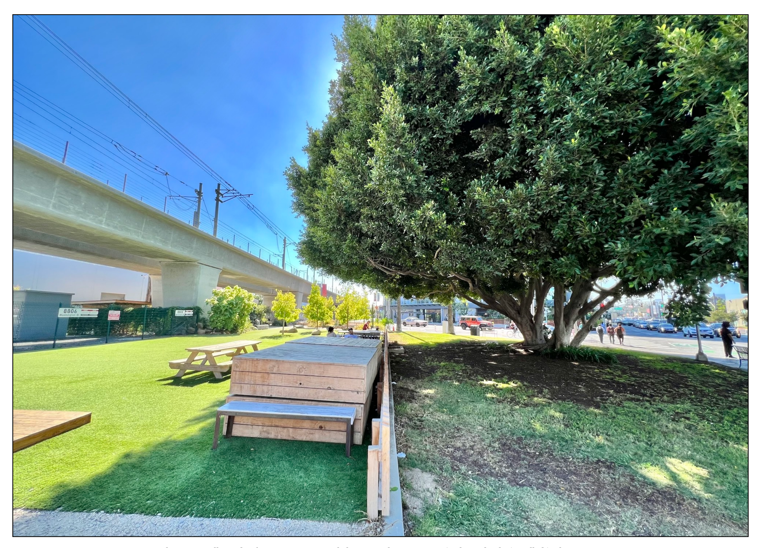
{\it Photo 4: Small wooden fence runs \ east-west \ below \ tree \ where \ structure \ is \ planned \ to \ be \ installed \ in \ the \ canopy.}