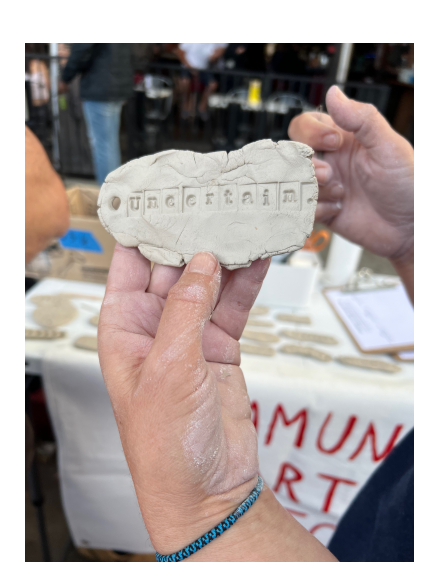
From Handbuilding Class (Senior Center)