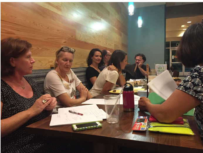
Parent champions are the lifeblood of SRTS programs. In Culver City, Walk 'n Rollers coordinated various opportunities for parents to collaborate and share ideas.