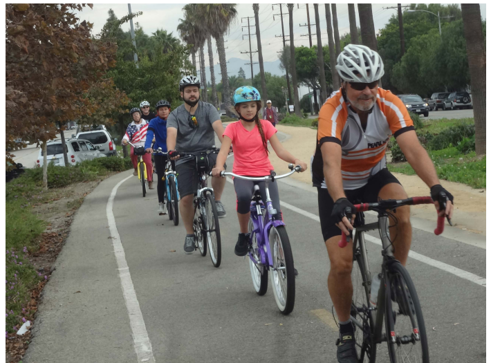
Group ride during a Wheels and Heels class.

As a value added element, Walk 'n Rollers has budgeted to include Walk Audits at each school to provide a thorough review of each site.