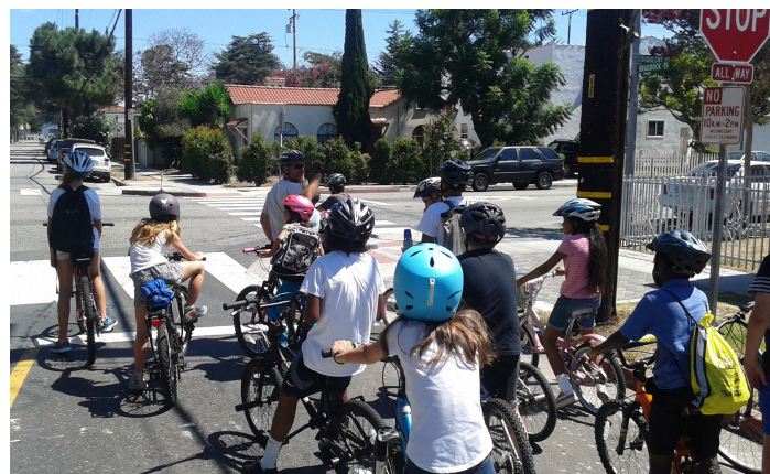
Incoming 6th graders are given a road safety lesson during the “Intro to CCMS” ride.