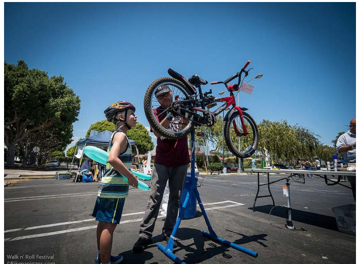
During Walk 'n Roll Festivals, children receive safety lessons in riding their bikes to school, and how to do a basic "ABC Quick Check" on their bikes.