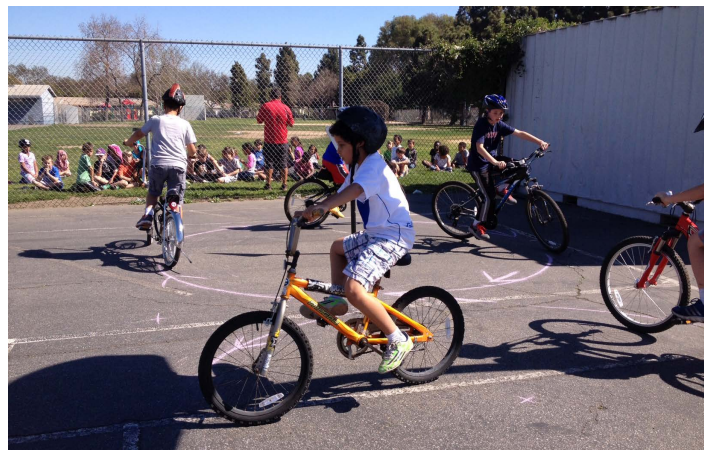
Elementary students participated in Bike Skills Workshops throughout Culver City. Walk 'n Rollers worked with PE teachers to train them to administer the program going forward.

At this time Walk 'n Rollers does not anticipate any additional fees not outlined above.