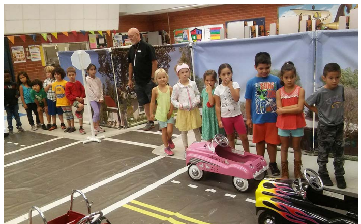
Children participating in a Pedestrian Workshop during PE.