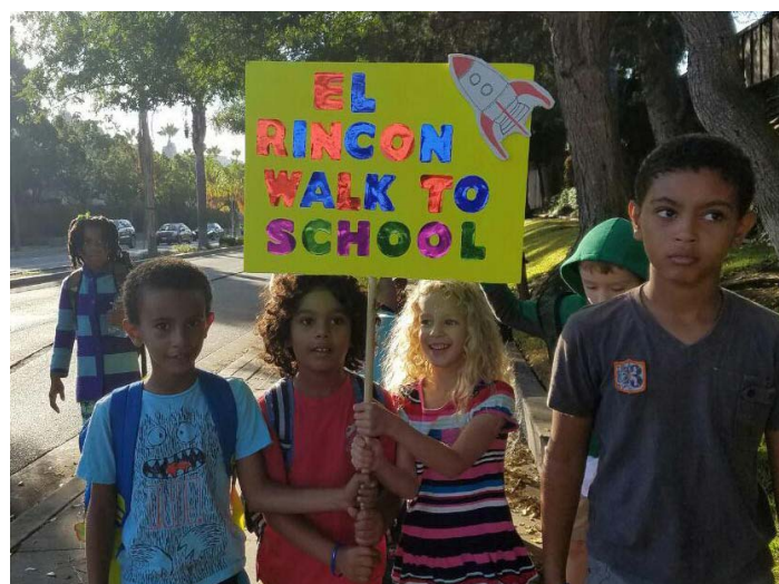
El Rincon developed a robust monthly Walk to School program under Walk 'n Rollers leadership.