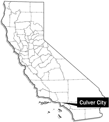
Fire Hazard Severity Zones (FHSZ) in Local Responsibility Area (LRA), as Identified by the State Fire Marshal